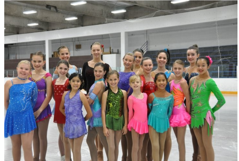
2011 Southwesterns send-off exhibition

DFSC is a non-profit organization. We rely on all our members to participate and assist in making club events a success. These events are organized and delivered for member support, advancement and to have fun in the sport.